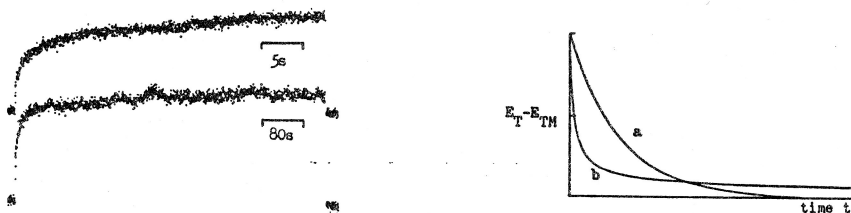
Figure 3. Comparison between I_C(t) observed, and predicted forms of E_T - E_{TM}

A quantitative theory of the phenomena remains to be developed. However, some features are clearly not easy to explain in FLR terms, but present no obvious problem if the pinning is of dislocations. One such is the slow decrease of E_{TM} with increasing I_C . This apparent persistence, when E \gg E_T , of concentrations of impurities, like that of mode-locking and broadening in nmr spectra [8], suggests that the local phase of the CDW advances in steps of 2\pi . This might be expected if the motion is of dislocations, but requires extreme assumptions if the FLR model is to apply.